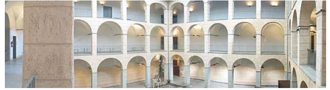
▲ the Hospicio building in Olot where the Catalan landscape observatory is based

The first is not a problem really because if it is true then