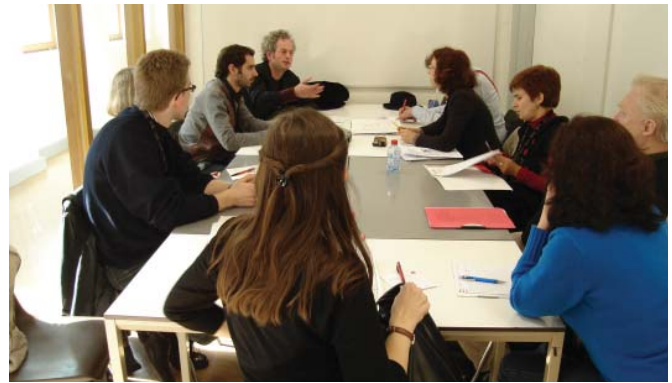
▲ LE:NOTRE Spring Workshop, Brussels 13-16 March 2008

The conclusion was that students can influence their teachers and motivate them to be more active in the network and also recruit high school students or younger students to study a discipline which deals with design, arts and even science and connects very different disciplines. These facts make this