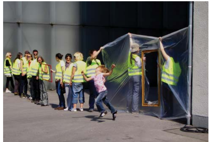
▲ Caption: ELASA minimeeting 2008: Workshop "visible/invisible borders in public space" in Bregenz, Austria.

At the LE:NOTRE Spring Workshop in Brussels 7 ELASA representatives from different countries participated in conferences and workshops including students perspectives into the proceedings of the LE:NOTRE project. Full of new