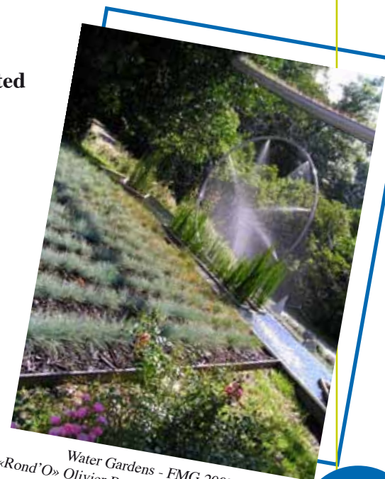
Water Gardens - FMG 2007 - «Rond'O» Olivier Berger / Alain Bietrix + FMG 2008 and 2009

Attention: if the real supplies expenses are lower then the estimated budget it is impossible to transfer the non used money to fees, accommodation or travel budget.