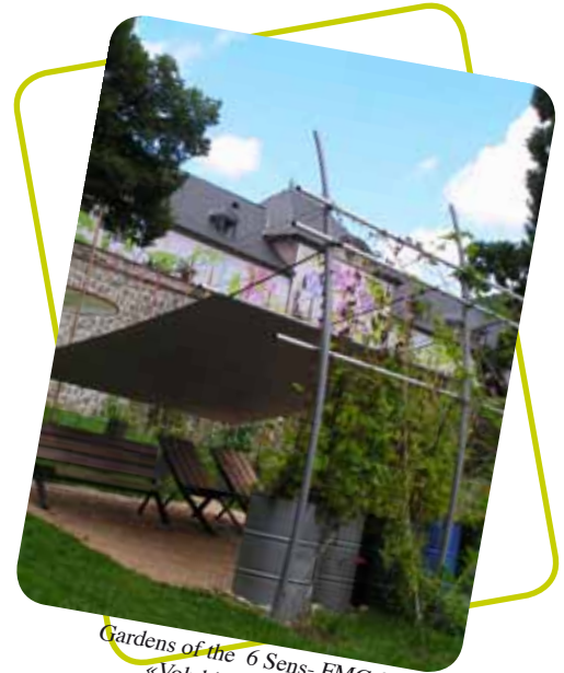
Gardens of the 6 Sens- FMG 2009 - «Volubilis et le métier à tisser» Jean-Marc Schneider