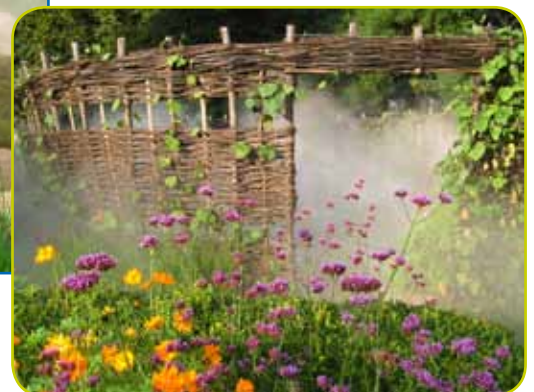
Water Gardens - FMG 2007 + FMG 2009 «Le jardin du vieux baquet» Céline Le Bris