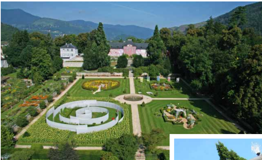
Rotary Gardens - FMG 2008

The Festival of Mixed Gardens is open to artists, landscape architects, municipal parks and gardens departments, architects, designers and students, etc. To be selected, they must show an ability to weave an original dialogue with the installation site, whose story is steeped in the textile industry. They must also comply with these specifications.